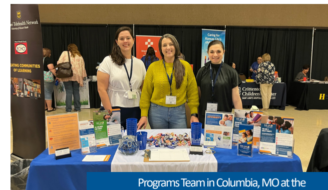
Programs Team in Columbia, MO at the Missouri Children's Trauma Network Training Summit