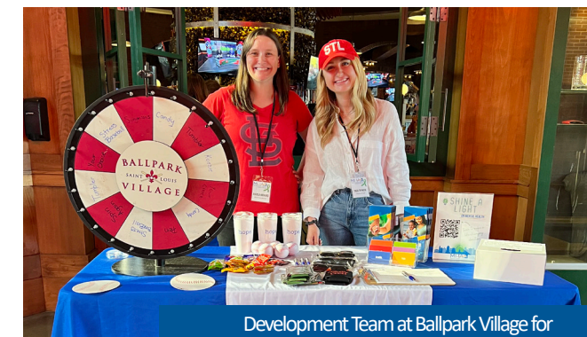
Development Team at Ballpark Village for Mental Health Night